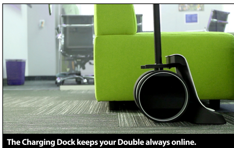
The Charging Dock keeps your Double always online.